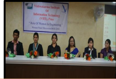
Under Women Empowerment Drive the "Role of Women Engineers in Workplaces and the challenges they faced at their workplace" – a panel discussion was held