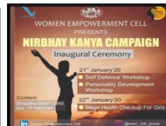
Nirbhay Kanya Health Campaign