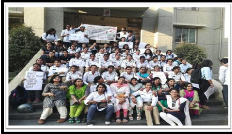
Women's Bike rally for Road Safety