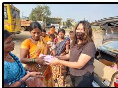
WEC donated about 1000 sanitary pads in the Padpeti For Every Beti drive.Those were donated to needy women in and around Pune.