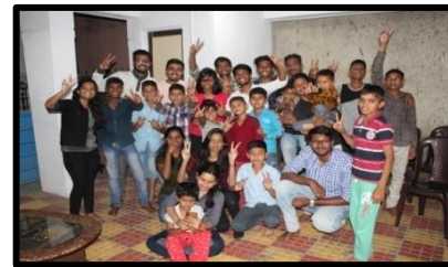
Visit to orphanage