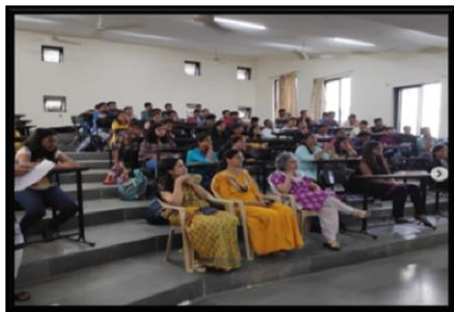
Women's health and wellness