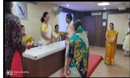
Seminar by Gynaecologist for women including class 4 women of Vishwakarma Institutes group